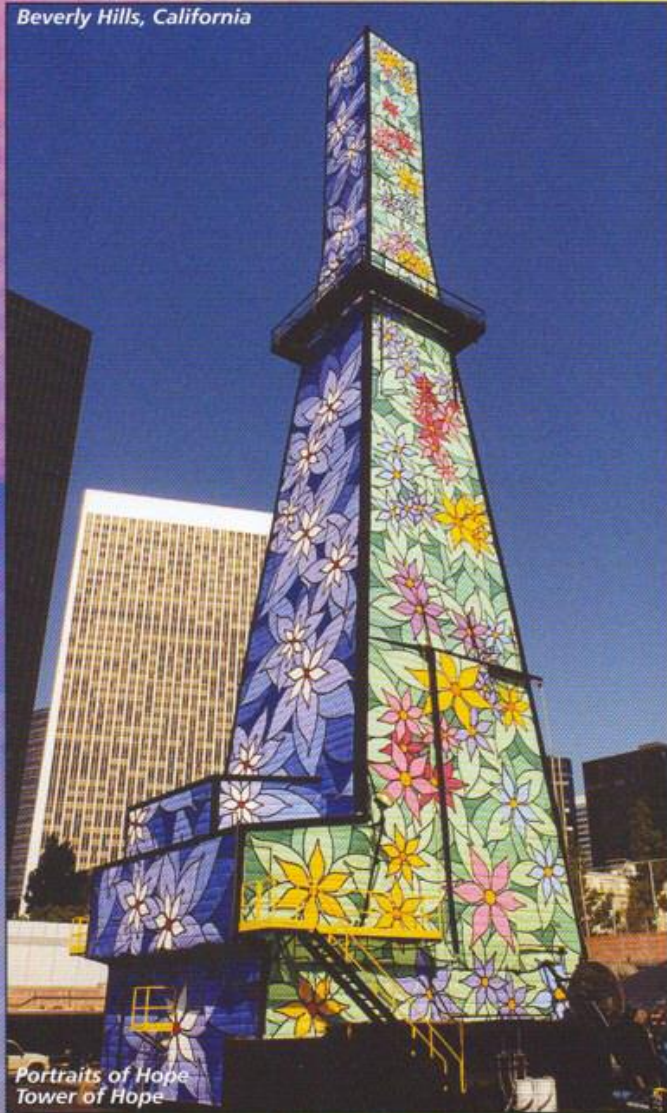
Beverly Hills, California

Awnings, Tension Structures & Canvas Products