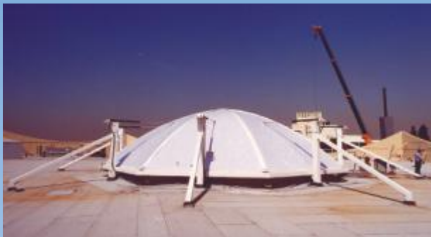
An outside view of a closed atrium cover system.

The unit's petal configuration is opened and closed by a hydraulic system to create this unique open-air atrium. When closed, the petals seal tightly to protect against rain and wind.