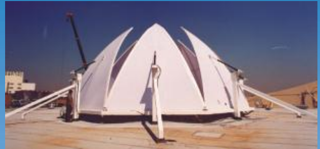
Mechanical skylight and atrium covering systems are just a few of the unique solutions offered by Eide Industries, Inc.

The unit's petal configuration is opened and closed by a hydraulic system to create this unique open-air atrium. When closed, the petals seal tightly to protect against rain and wind.