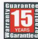
Guarantee 15 years