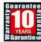
Guarantee 10 years