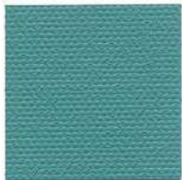
228MST Teal #808278