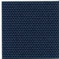
224MST Indigo #808274