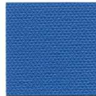
216MST Blue #808266