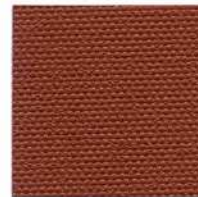
225MST Terra Cotta #808275