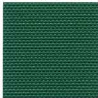
204MST Dark Green #808254