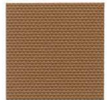
211MST Toast #808261