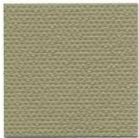
227MST Dark Linen #808277