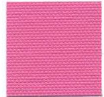
209MST Pink #808259