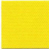
202MST Yellow #808252