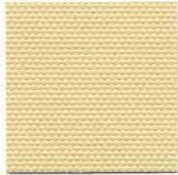
229MST Ivory #808279