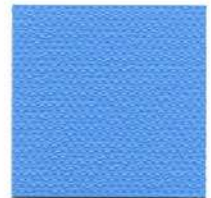
205MST Turquoise #808255