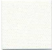
215MST White #808265