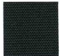
214MST Black #808264

Main Street ® is a registered trademark of Glen Raven, Inc.