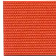
201MST Orange #808251