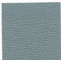
213MST Grey #808263