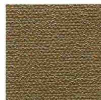
233MST Bronze #808283