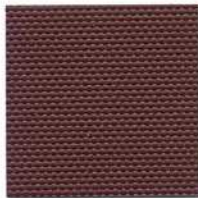
210MST Cranberry #808260