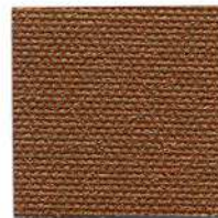
234MST Copper #808284