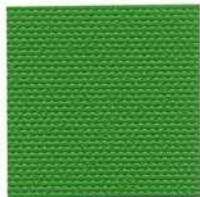
203MST Grass Green #808253