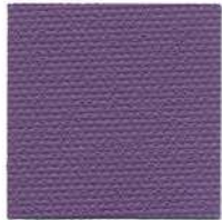
207MST Dark Lavender #808257