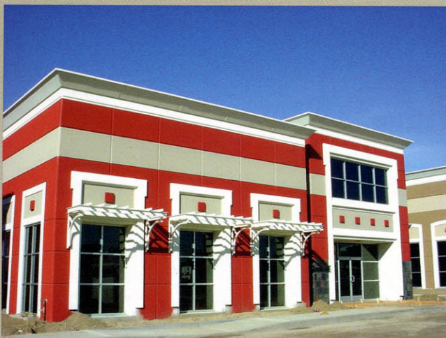
Eide Industries offers a large variety of custom Trellis shapes including custom perimeter and projection arm styles.