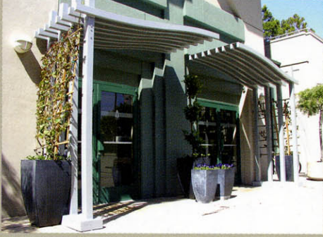
The Wave Awning is available with custom radius members. The Wave may be mounted directly to a wall or supported by upright legs.