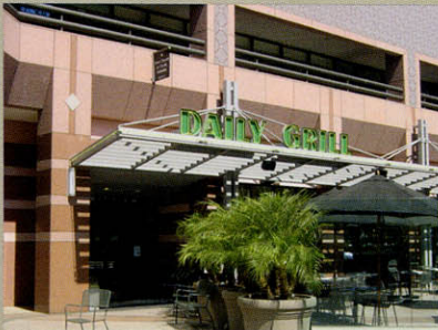
Louver Awnings are available with or without upright supports and can easily support additional live and dead loads.