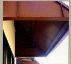
Standing Seam Awnings are available with a variety of seam spacing and radius shapes.