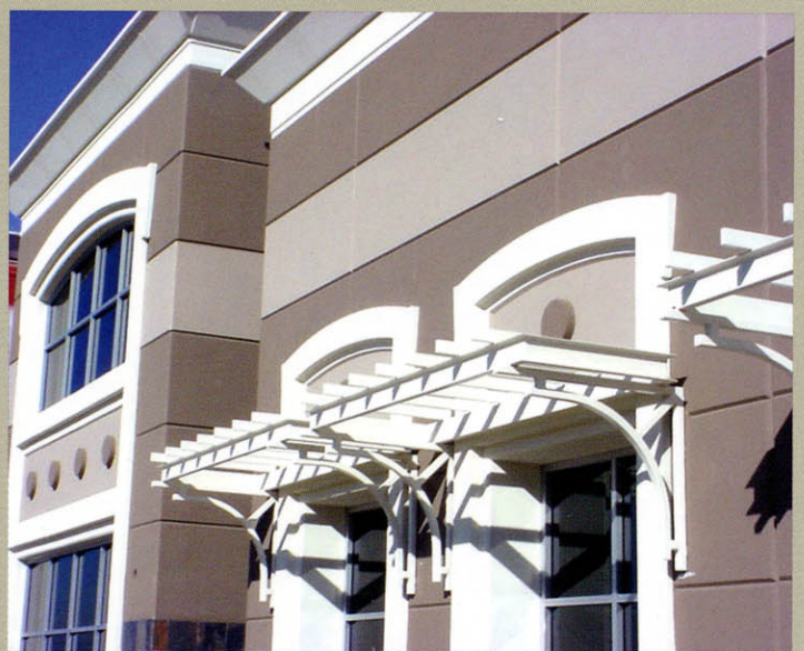
Eide Industries, Inc. custom metal awnings include specifications, shop drawings and engineering calculations. For more information about our custom metal awnings, call Eide Industries' sales department.