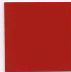
XL27 Tomato Red* #859527

Reflections ® is a registered trademark of The Astrup Company.