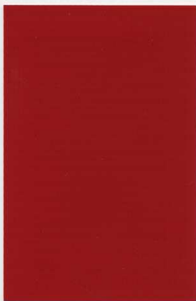
XL09 Scarlet #859509