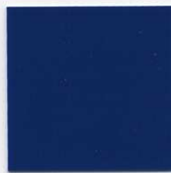
XL01 Royal Blue #859501