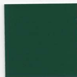
XL03 Forest Green* #859503