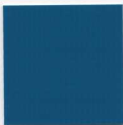
XL04 Turquoise #859504