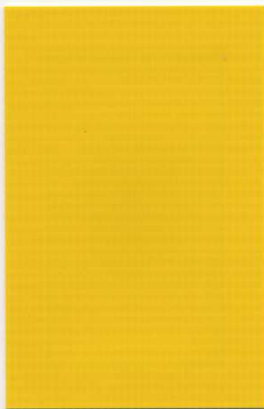
XL06 Gold #859506