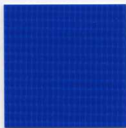
XL12 Blue* #859512