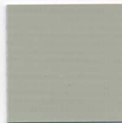
XL40 Light Gray #859540