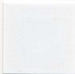
XL17 White* #859517